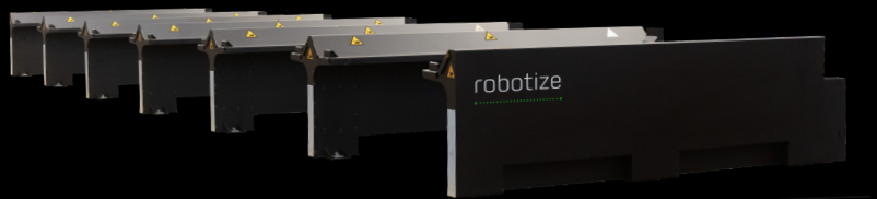
Passive Station Expansion