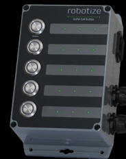
Call Button (Multi)