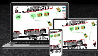
GoControl Fleet Manager