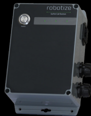
Call Button (Single)